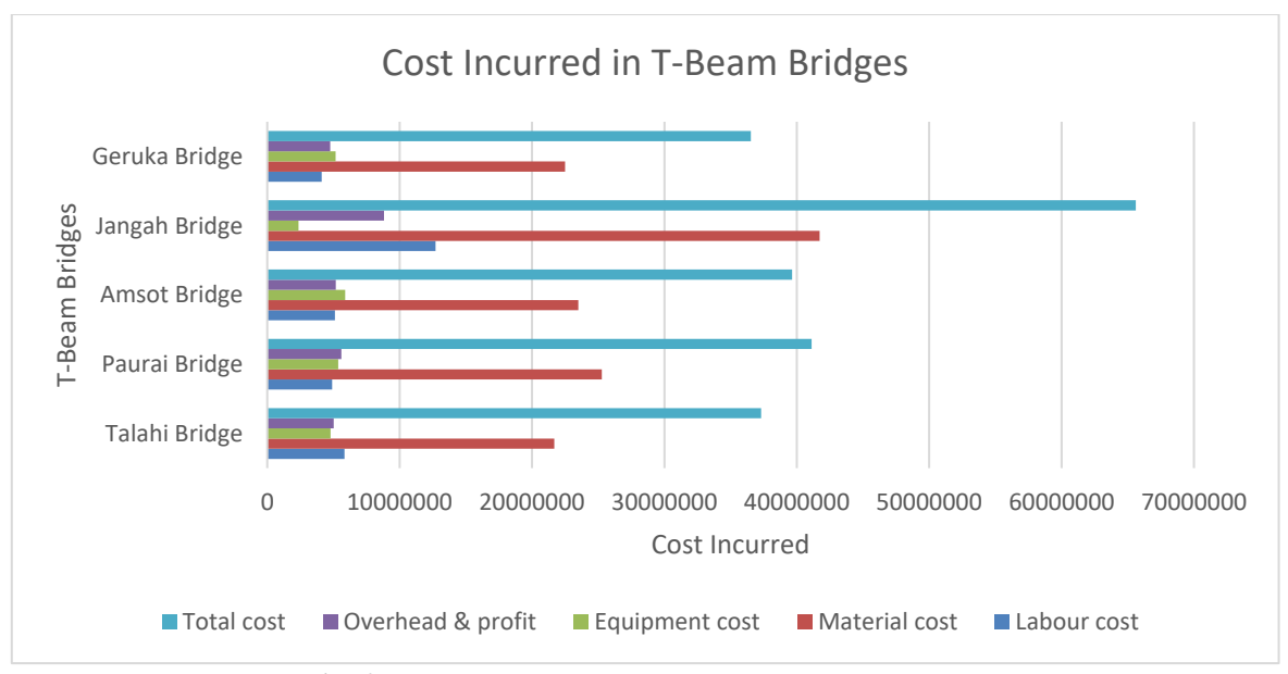
Fig. 2: Summary of Cost Incurred in T-girder Bridges

All the so calculated coefficients are averaged for better result: